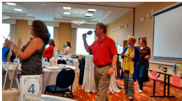
AJI Module V: Students of Institute learn and have fun too!