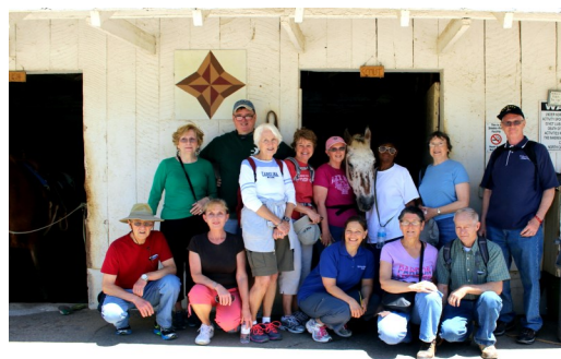
Ruffy-Holmes Senior Center Outdoor Adventure Club at Tanglewood Park for horseback riding and hiking.