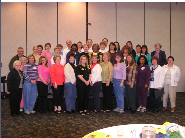
The First Graduating Class of the Ann Johnson Institute